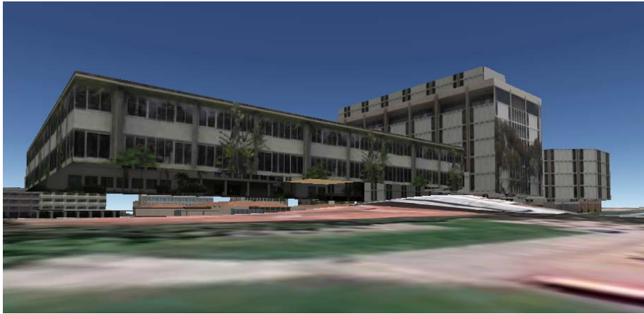
Figure 1: An error in the underlying DEM causes the Davidson Library on the UCSB campus to appear to float 6 meters above the ground within Google Earth.

The minimization of Type II errors is similarly important for DEMs derived from LiDAR that are to be used visually. The visual errors associated with these kinds of errors produce landscapes that bear little resemblance to their real life counterparts. In many cases, other objects that are intended to be placed on or near the ground may be placed incorrectly as a result of such errors. An example of this may be found on the UCSB campus, where the very large library building (approximately 75 m x 175 m) causes a local error in the National Elevation Dataset derived ground layer used in Google Earth. When a COLLADA model of the library is snapped to this ground layer, it appears to float about 6 meters (i.e., the height of the local error) above the ground (Figure 1).