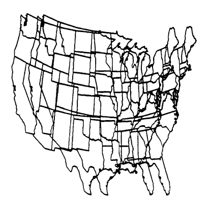
Fig 1(a). USA Map - Shifted and Overlaid on itself